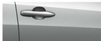
1H5 Manhattan Grey §