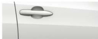
040 Pure White

The accessories above are a small selection from our wide range. Visit the Toyota website to find the complete overview.