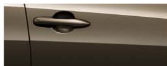
6X1 Oxyde Bronze §