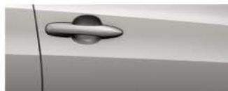
1F7 Ultra Silver §