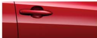
3U5 Flame Red*