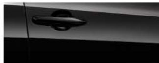
209 Night Sky Black §