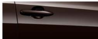
4W9 Mocha Brown §