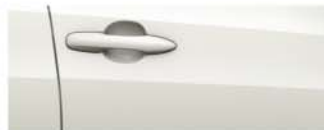
070 Pearl White*