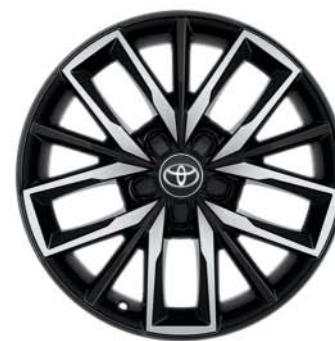
17" black machined-face alloy wheels (5-double-spoke) Standard on TREK