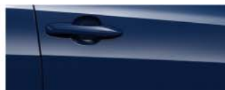
8Q4 Marine Blue