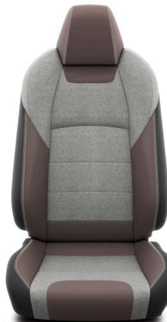
Brown and grey fabric with grey stitching Standard on TREK