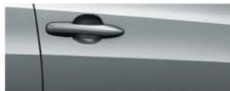
1J6 Platinum §