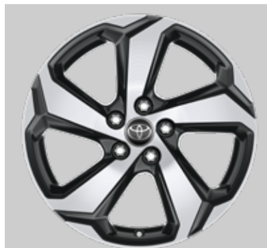
18" grey machined-face alloy wheels (5-spoke) Standard on Executive

Complete your look with a choice of head-turning 18" or 19" machined-face alloy wheels. Inside the new RAV4 Plug-in Hybrid, black trim options range from Alcantara® to genuine leather with contrasting red stitching, to add an extra touch of sportiness.