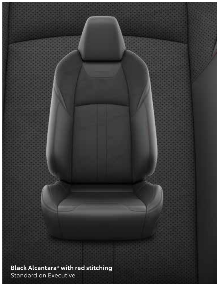
Black Alcantara® with red stitching Standard on Executive