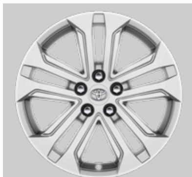
18" silver machined-face alloy wheels (5-double-spoke) Optional on all grades