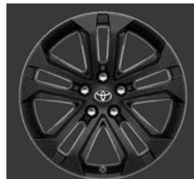
18" matt black machined-face alloy wheels (5-double-spoke) Optional on all grades