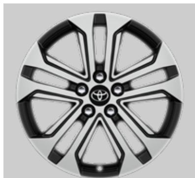
18" machined-face alloy wheels (5-double-spoke) Optional on all grades