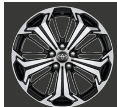
19" black machined-face alloy wheels (5-spoke) Standard on Premium