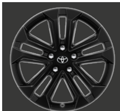
18" glossy black machined-face alloy wheels (5-double-spoke) Optional on all grades