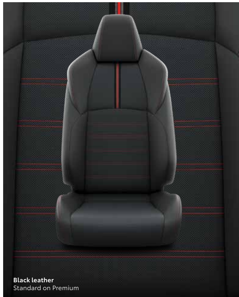
Black leather Standard on Premium